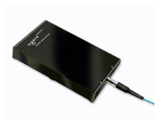
Manufactured in a low-profile, 24-pin package, the R480-Type receiver features either an avalanche or PIN photodetector, a transimpedance amplifier, and a limiting amplifier IC.