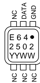
TOP VIEW THE DOT MARKS PIN 1

YYWW = DATE CODE RR = DIE REVISION CODE CCCCC = COUNTRY CODE