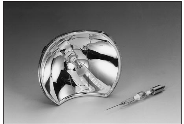
▲ Center : L4342-01, Right : L4342