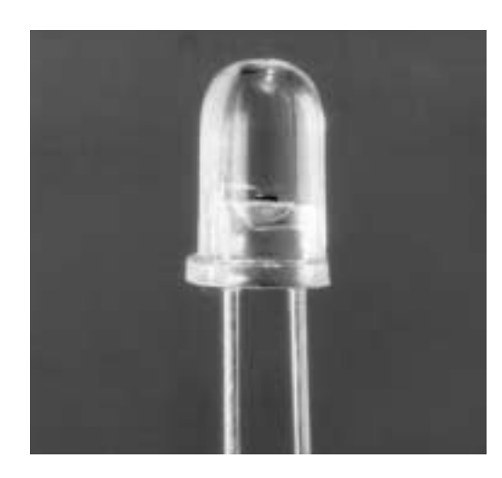
(Also available in infrared transmitting visible blocking version)