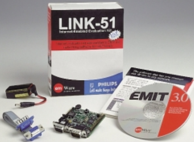
LINK-51 Evaluation Kit