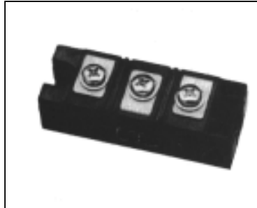
QR_3310001 Fast Recovery Diode Module 100 Amperes / 3300 Volts