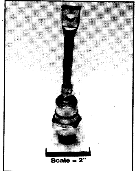
R602__22/R603__22 Fast Recovery Rectifier 220 Amperes Average, 1600 Volts