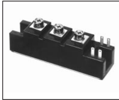
CM4312A2, CM4316A2 Dual SCR POW-R-BLOK™ Modules 25 Amperes/1200-1600 Volts