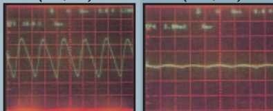
Output from the RAM (2mV/cm)